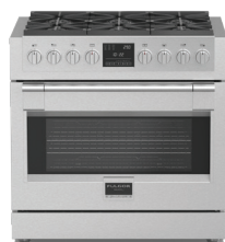
STAINLESS STEEL FSRC 3606 P MG ED 2F X

Probe for detection the temperature in food 1 telescopic rack with total extraction 2 flat metal grids 1 enameled tray with anti-splash Interior lighting Internal capacity 161 liters