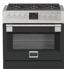
MATTE BLACK STEEL FSRC 3606 P MG ED 2F MBK