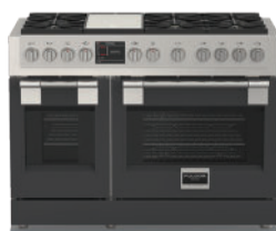
MATTE BLACK STEEL FSRC 4807 2P MK 2F MBK