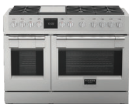
STAINLESS STEEL FSRC 4807 2P MK 2F X

Support oven: 1 telescopic grate with total extraction 2 flat metal grids Internal capacity 76 liters