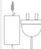
Power Supply x 1