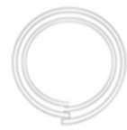
PE Tube x 2